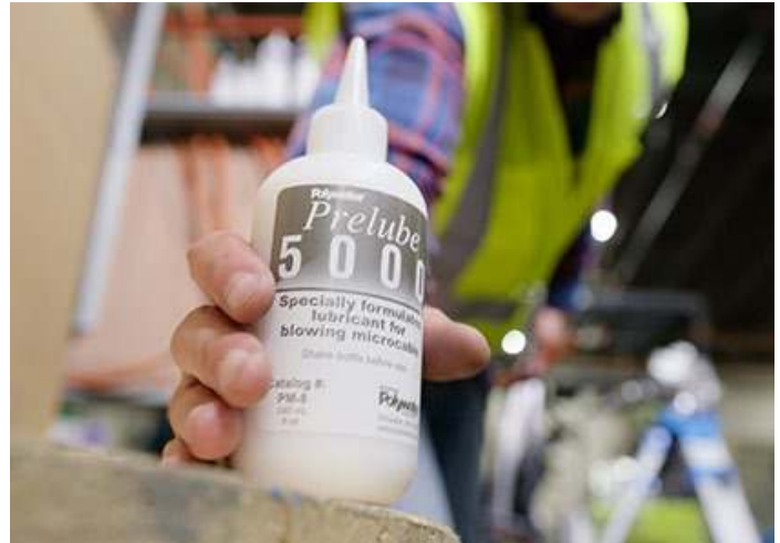
Prelube 5000 applied to duct prior to blowing fiber cable