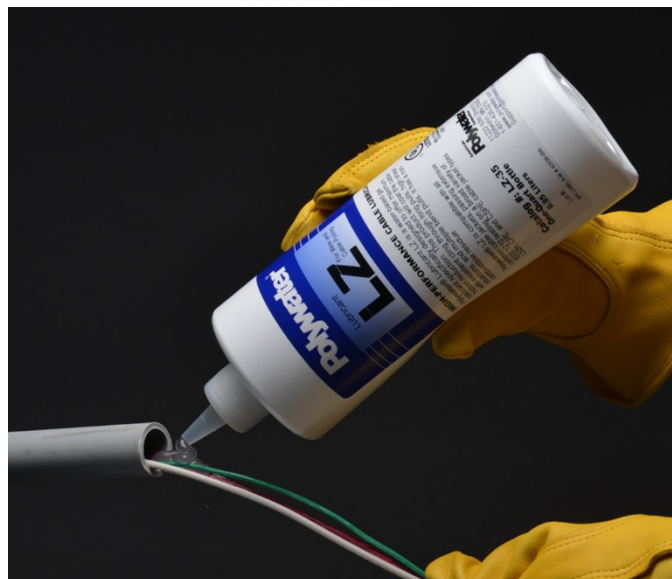
Polywater LZ is a specification grade lubricant

Coefficient of friction data on additional or specific cable jackets or conduits can be obtained from American Polywater Corporation.