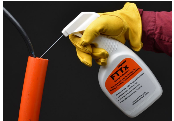
Polywater FTTx can be sprayed into small conduits

Meets MS-5/20xx Model Specification for HDPE Solid Wall Conduit for Power and Communications Applications.