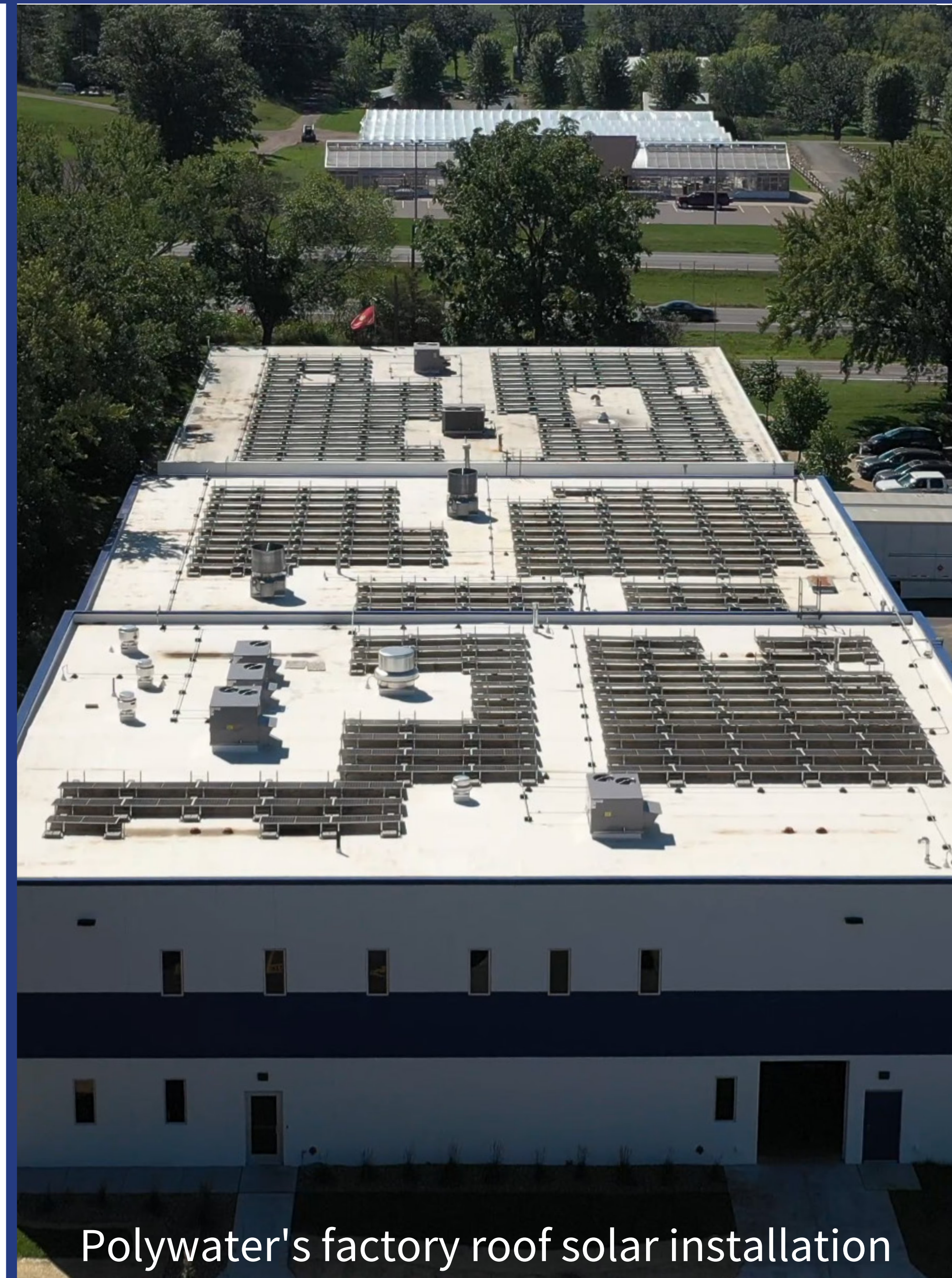
Polywater's factory roof solar installation

Polywater supports global sustainability initiatives through continuous analysis and improvement of our products, production methods, and transportation modes. Environmental impact and human rights are key considerations in the selection of our raw materials, packaging, and energy needs. While our product innovations are designed to support the rollout of renewable energies, many formulations and R&D efforts also target the repair and maintenance of legacy infrastructure with the goal of increased efficiency, longer lifespan, and lower environmental impact compared to full replacement.