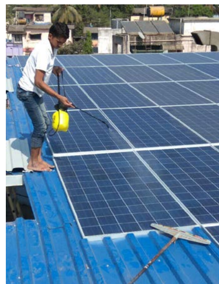
Water sprayed onto the panel