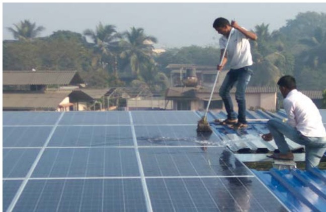
Water cast onto the panel with a hose

Water Consumption Tests —American Polywater has quantified water use in a number of PV installations around the world. In all comparisons, American Polywater's Solar Panel Wash™ (SPW) reduced water use significantly. There are three basic steps in cleaning PV panels: Soaking/cleaning, scrubbing and rinsing. Water is always consumed in the soaking and rinsing steps. When special cleaning equipment is employed, water can also be consumed in the scrubbing step. In the tests described below, water is either cast, e.g., thrown from large plastic cups/pails and/or hosed, or sprayed onto the surface of the protective glass in the soaking and rinsing steps. These comparison tests measured the amount of water used in the soaking and rinsing steps using only water vs those same steps using an H 2 O/SPW mix in a 25:1 ratio.