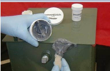
Apply PowerPatch over putty patch or leak area

Empty all the contents of the Part B Cup into the larger, Part A Cup. Mix for about 1 to 2 minutes until the mixture is a uniform grey color.