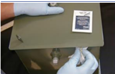
Clean area with cleaning wipe before applying sealant

For an active leak, apply Putty Stick to temporarily stop flow. If there are no active leaks, go to instruction 4.