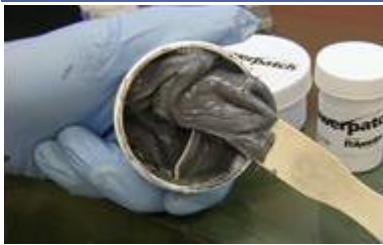
Mix 2-part paste sealant to a uniform grey color