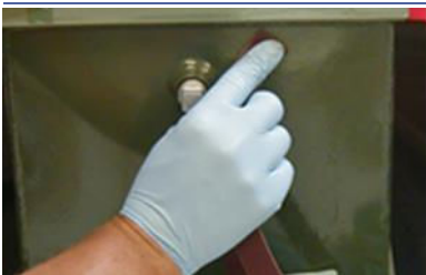
Sand or brush repair area