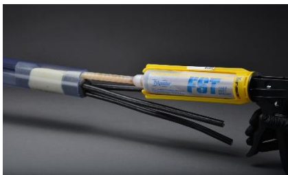
Duct sealing options