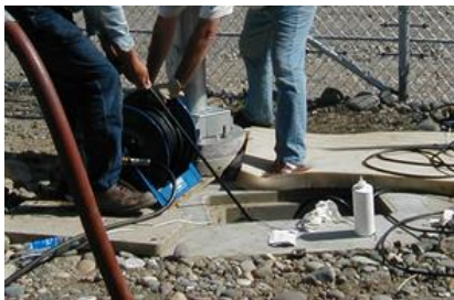
Removing hose during filling