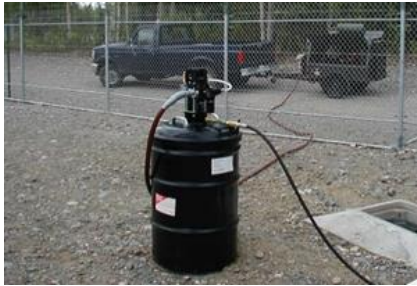
IceFree drum with grease pump attached.