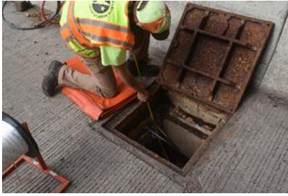
IceFree installation site.