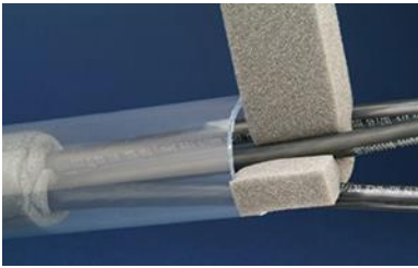
Separate cable(s) with foam