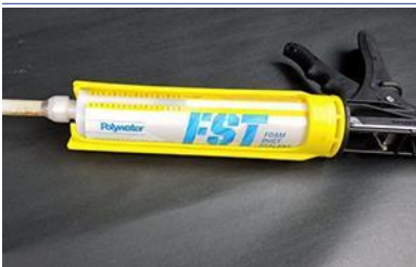
TOOL-250 with FST-250

Holding cartridge upright, remove nut and plug. (Plug can be saved for re-use of cartridge.) Attach static mixer and tighten into place.