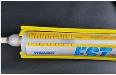
Mark on side of cartridge