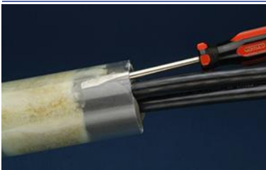
Use screwdriver to check for voids

Static mixer is reusable 7-10 minutes after injection.